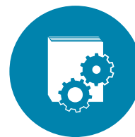
WORKPLACE & CLASSROOM LEARNING