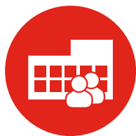
MARKET RELEVANT SKILLS